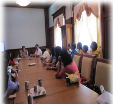
OWWA Administrator's brief consultation with the OFW groups